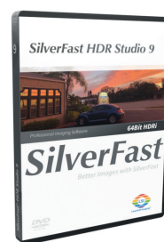
SilverFast HDR Studio