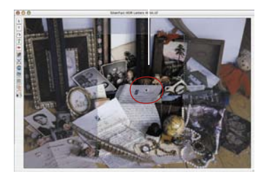
Densitometer measuring point in prescan

Four densitometer measure point can be fixed on the prescan which are saved in the zoom. To fix a densitometer point, just press the "Shift" key and click the mouse. Do the same to release the densitometer point again (refer Chapter Multiple FixPip, Page 122).