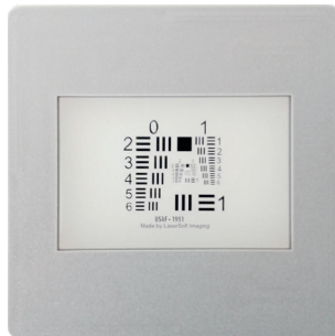
SilverFast 35mm Resolution Target (USAF 1951)

More information on our SilverFast Resolution Targets (USAF 1951), in-depth instructions as well as additional application and background can be found here: www.SilverFast.de/Resolution-Target