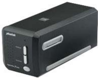
Plustek OpticFilm 7200i SE Scanner