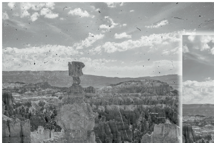
The Original Image including Scratches

Photos, slides and negatives are naturally afflicted with image defects. Even if photos and slides are handled very carefully, it's virtually impossible to avoid contact with dust particles; small scratches are also not uncommon. Greater defects on treasured images can be especially annoying, because they often hide important details or even destroy the overall image. These flaws do not often get recognized until scanning, because scanning means also increasing image size in most cases. SRDx is the efficient solution for the elimination of all these flaws.